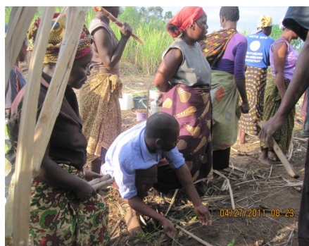
Preparing the ground and planting the crops

The first volunteer farmers have attended five days of training including preparing the garden and planting.