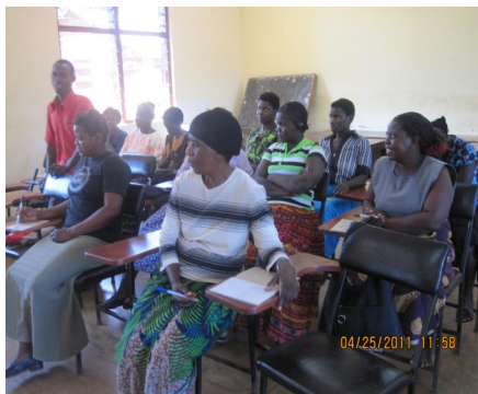
Villagers learn crop husbandry

A Community Garden is now the third project to be completed. Theoretical and practical training and experience are provided