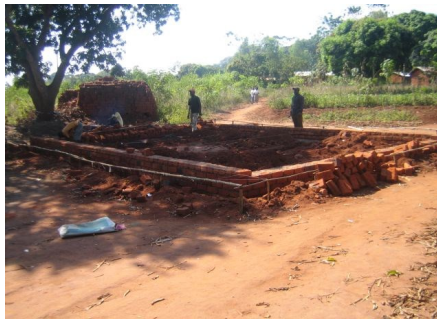
Sitolo Community Shelter under construction

A second project provided a Community Shelter for the village. A multi purpose building providing a village gathering point.